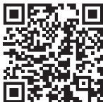
Smartphone app control (WL-Box1 video)