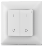
PF1-2 2 zone remote